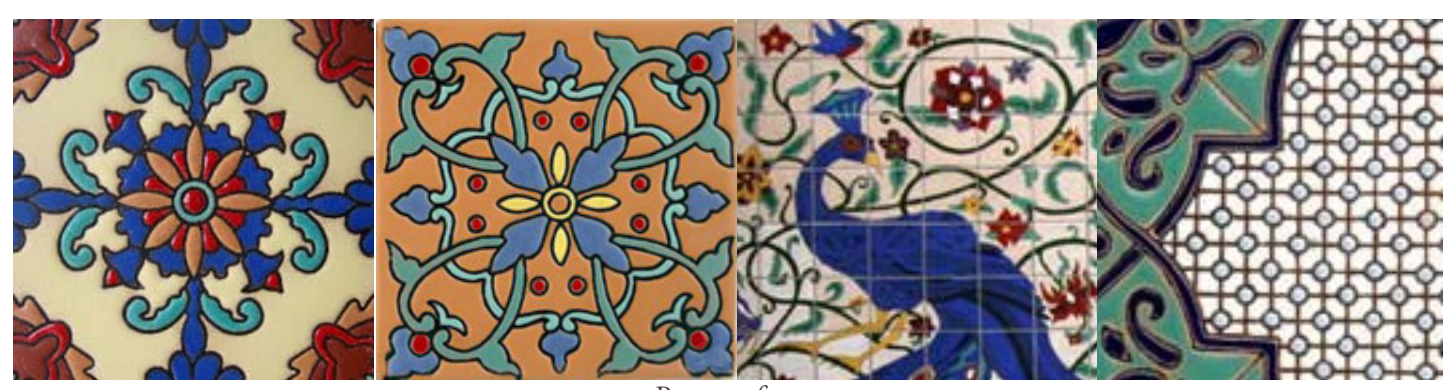
PAGE 3 of 14