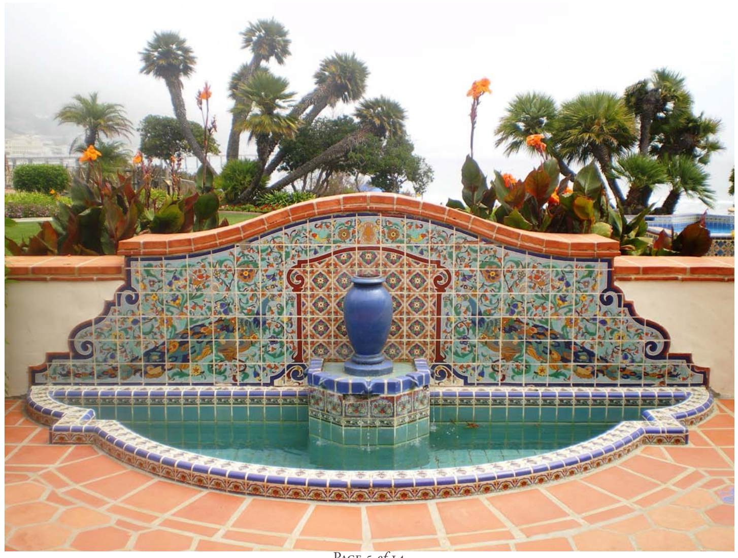
PAGE 5 of 14