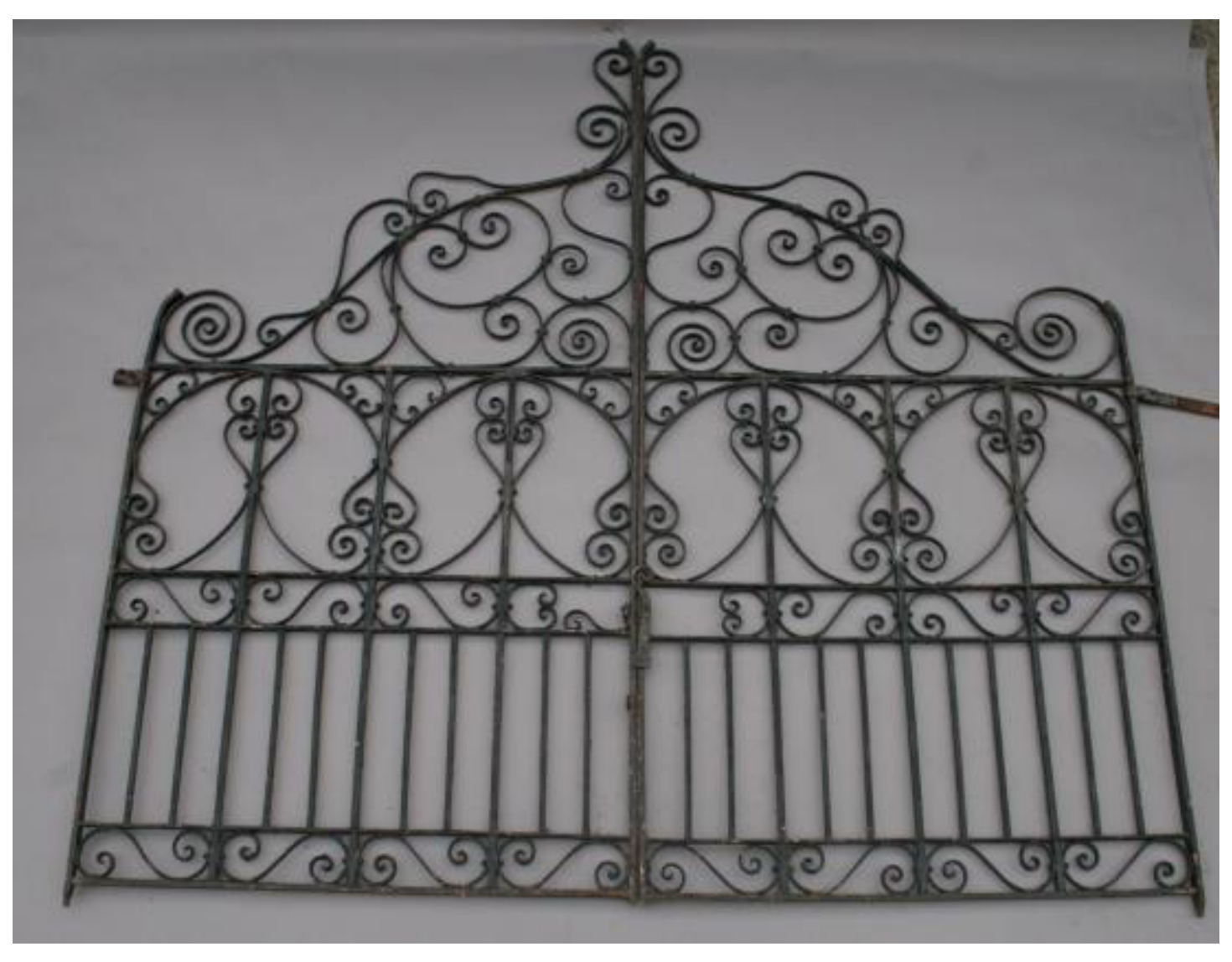
PAGE 9 of 14